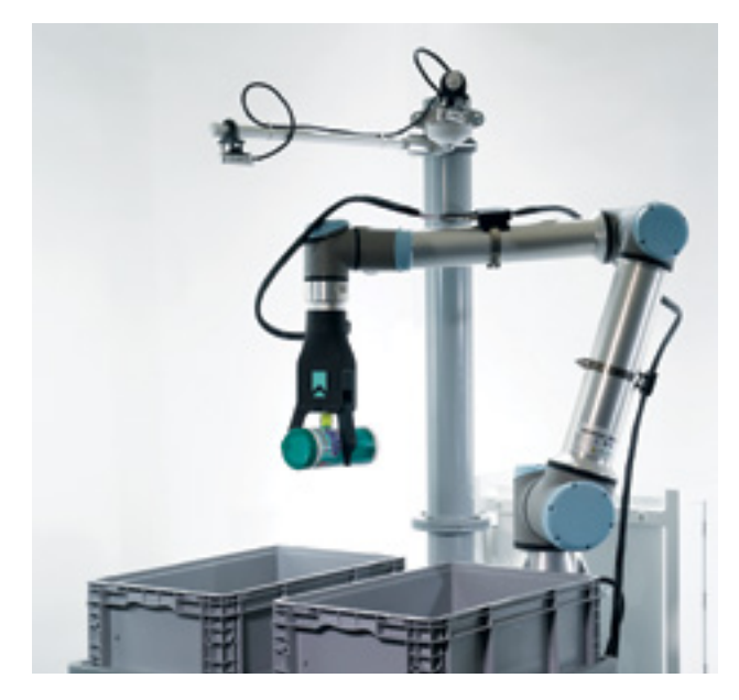
RightHand Robotics has united model-free vision, machine learning, and flexible, compliant grippers with integrated sensors to maximize throughput like in this bin-to-bin picking program.

Collaborative robots can teach themselves to pick things they've never handled before in unstructured environments like a bin or tote. Instead of storing massive data sets of 3D models for scanners and grippers to recognize, cobots use flexible grippers that combine suction,